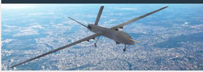
Applications: Beyond Visual Line of Sight Communications