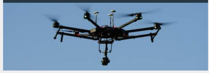
Applications: Compressed Photo and Video Data Transfer